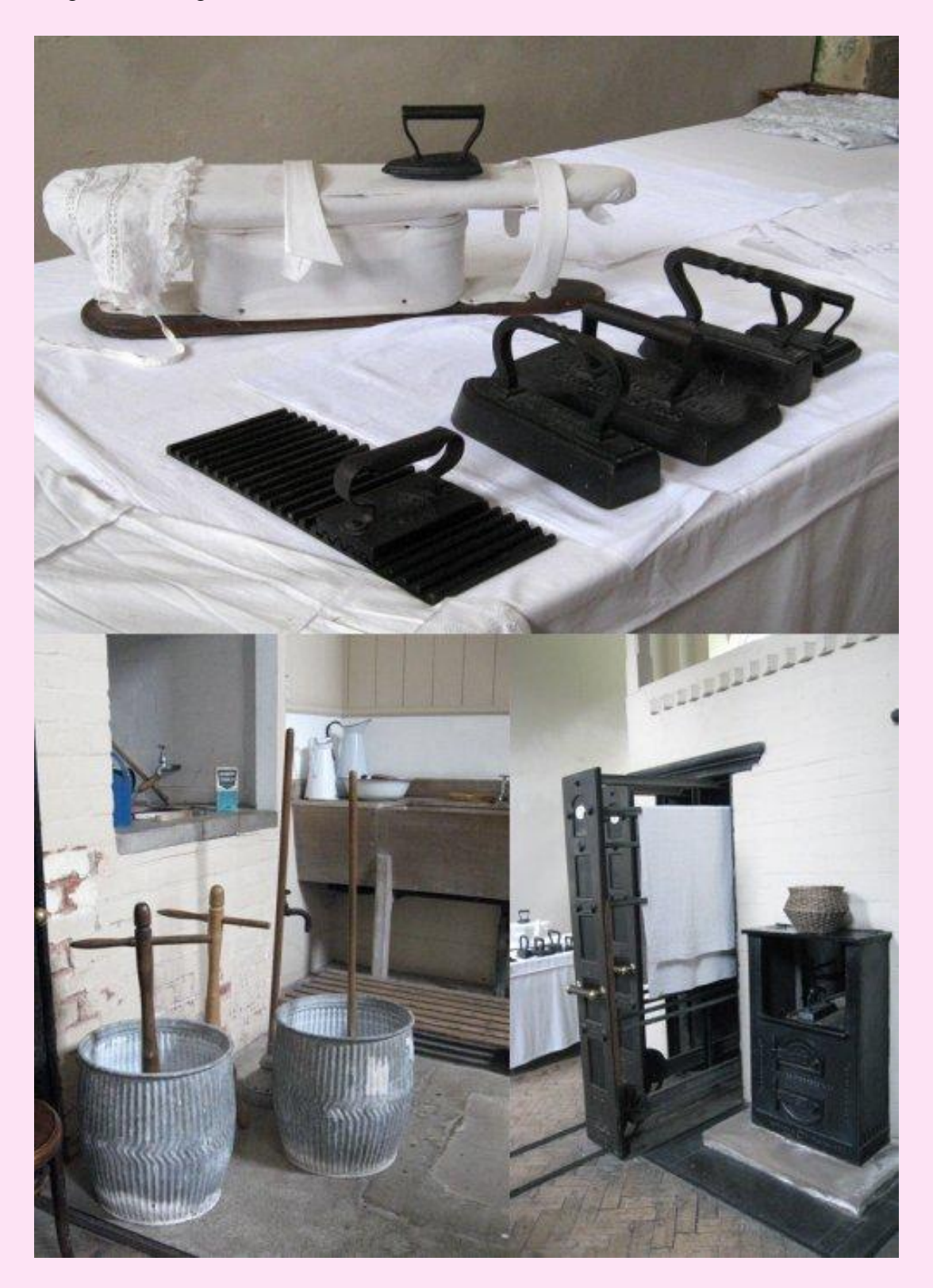
Irons, dolly tubs, drying oven and open oven for heating flat irons in the laundry.

in the dolly tub which was very hard on the fabric! I remember my mother having one before she bought a washing machine in the 1950's.