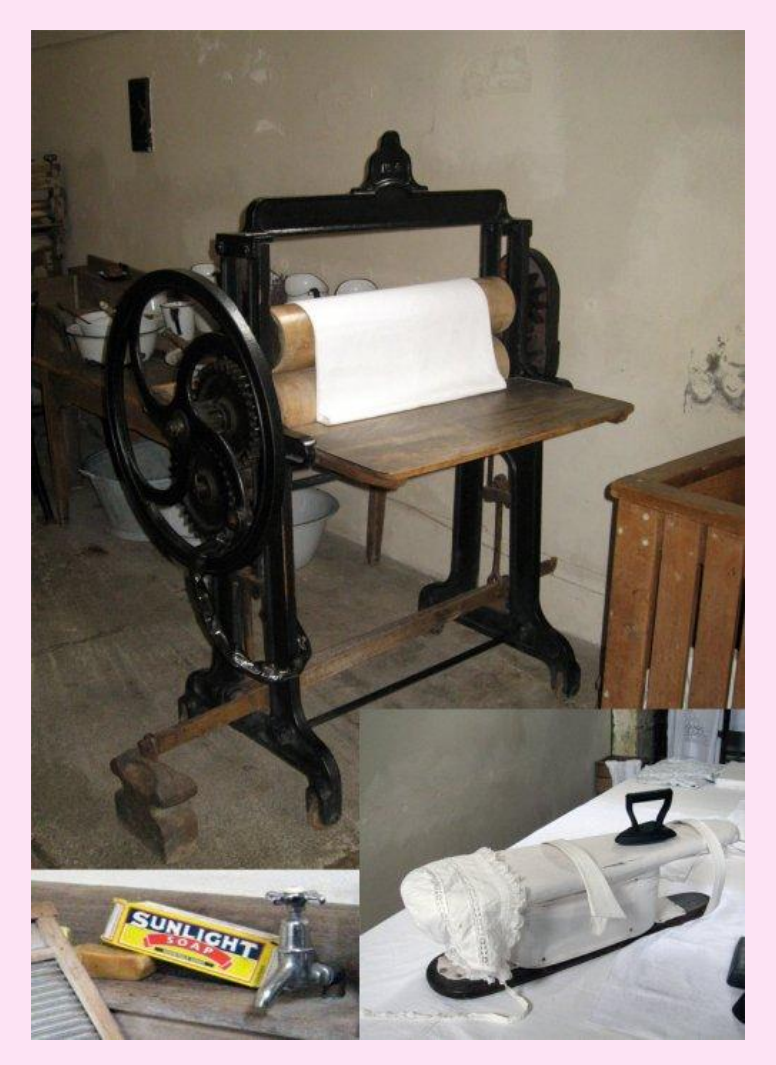
The dreaded mangle and Sunlight Soap! From the mangle and the dryer the laundry moved to the ironing. A polishing iron is being used for the collars. Starch was also used to great effect.

Once the washing had been completed, the linen was passed through the mangle several times to remove the excess water. The mangle consisted of a heavy pair of wooden rollers well known for catching unwary fingers. It was also used after the linen had been dried for pressing and smoothing to remove the creases from sheets and table linen.